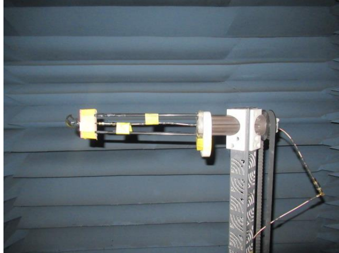
Fig. 2-1 Test position Free Space

Place and fix it with tape shown as below.