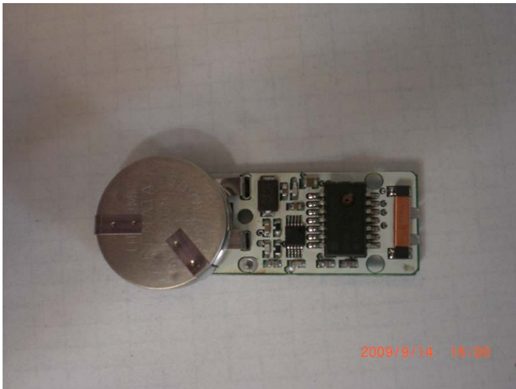
Front View with battery