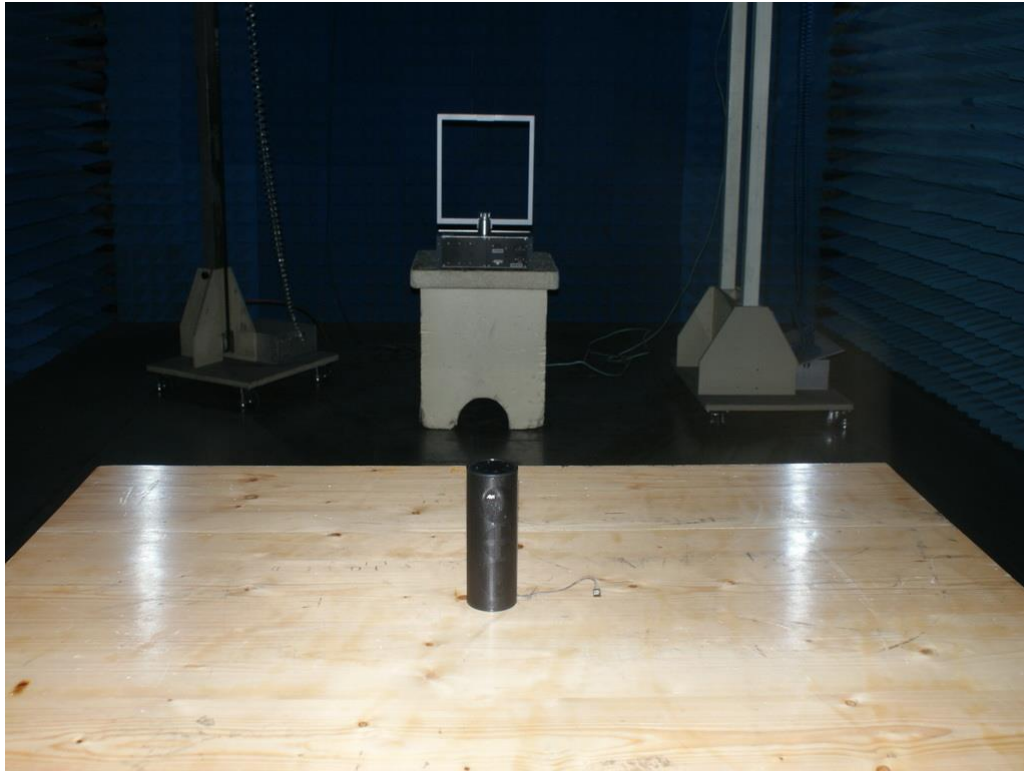
Photograph 1: Set-up for Spurious Emissions (9kHz-30MHz)

Type Designation: NS-SPBTWAVE2 Report Number: XMF-SPBTWAVE2