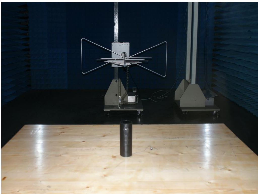
Photograph 2: Set-up for Spurious Emissions (30MHz-1GHz)