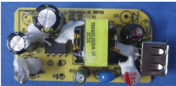
PCB SIDE 1