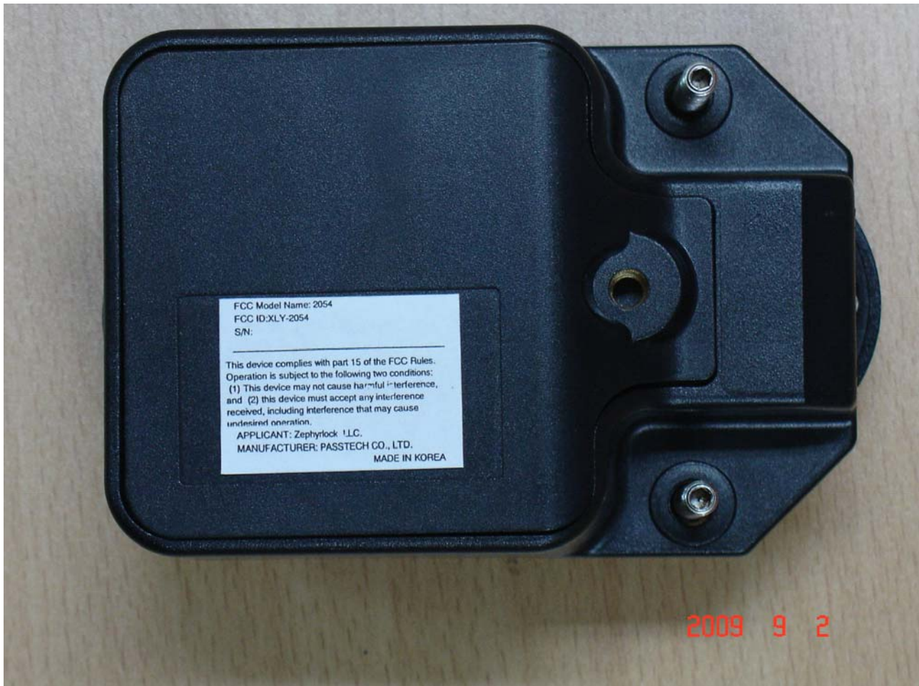
Figure 1.2 LABEL LOCATION

The label shown shall be permanently affixed at a conspicuous location on the device and be readily visible to the user at the time purchase.(Labeling requirements per 2.925)