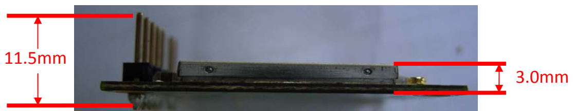
Figure 1 - Outline Drawing of the FS-GM101