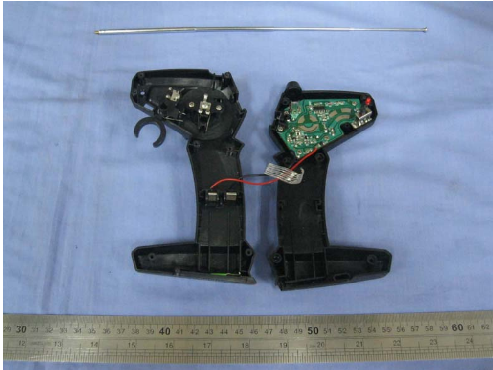
Internal View of EUT