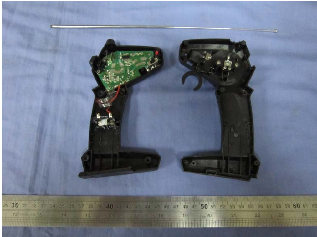
Internal View of EUT