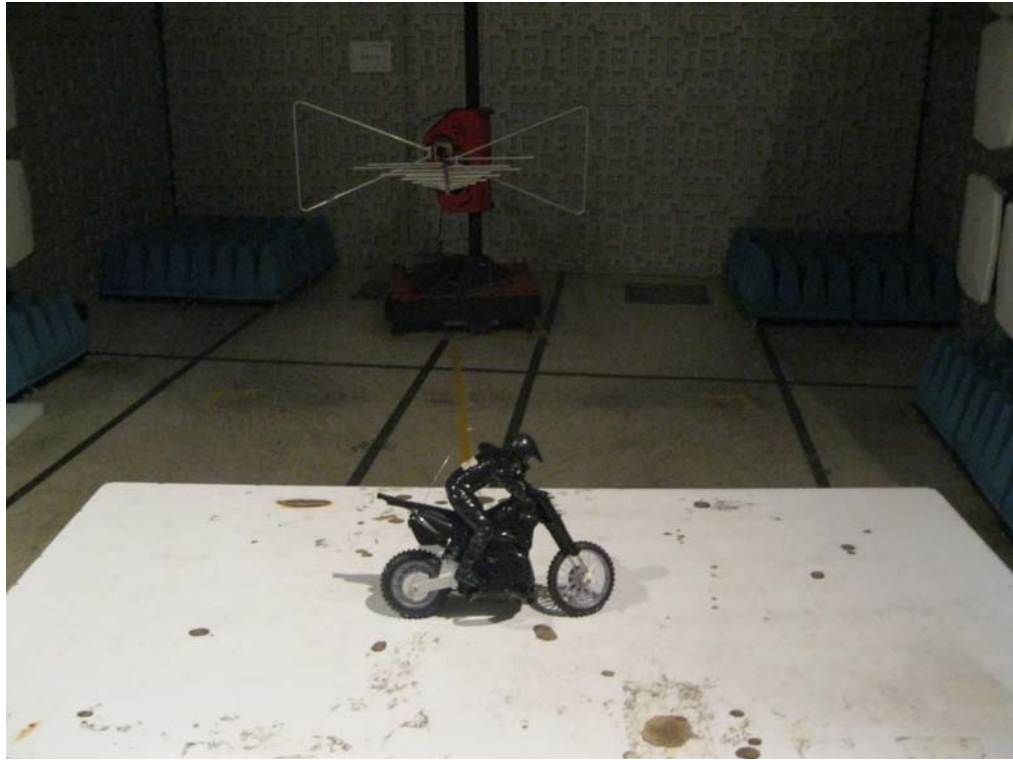
RADIATED EMISSION TEST SETUP (FOR RECEIVING MODE)