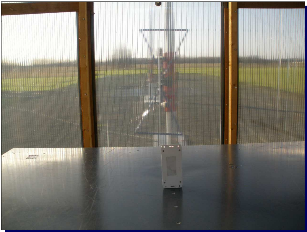
Photograph 2 EUT - Back