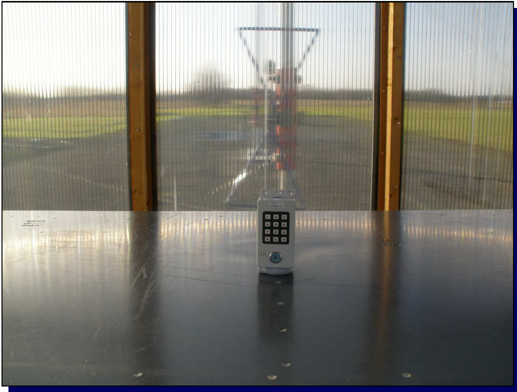
Photograph 1 EUT - Front