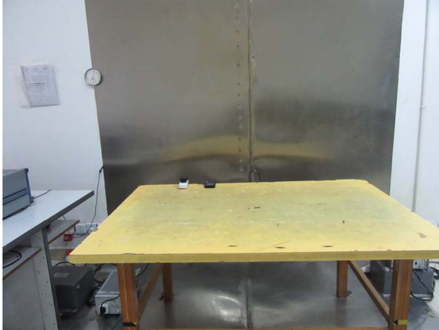
Conducted Emissions – Side View