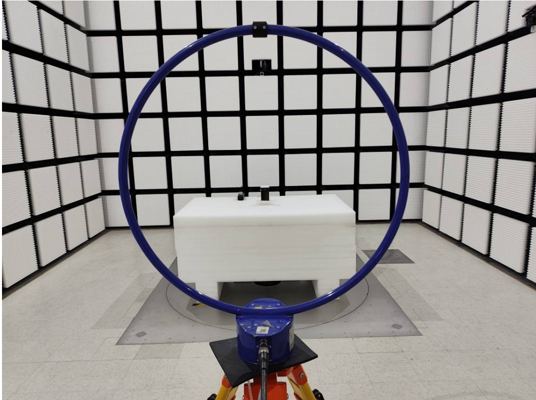
Radiated Emission 9k-30MHz Perpendicular View Adapter 3# + IPS