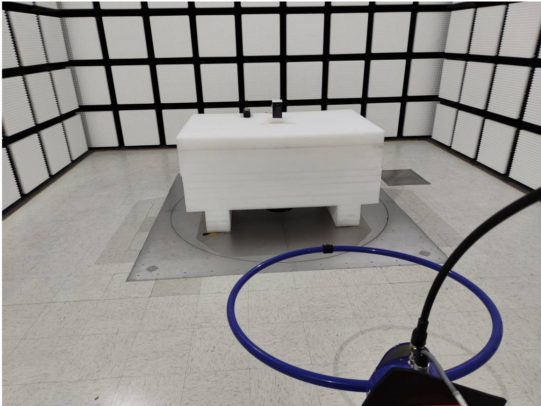
Radiated Emission 1GHz View Adapter 3# + IPS