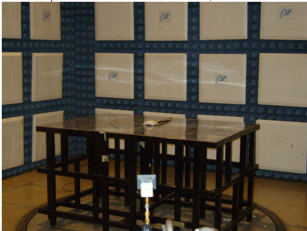
Test Setup for Radiated Emissions – 18GHz to 25GHz, Vertical Polarization