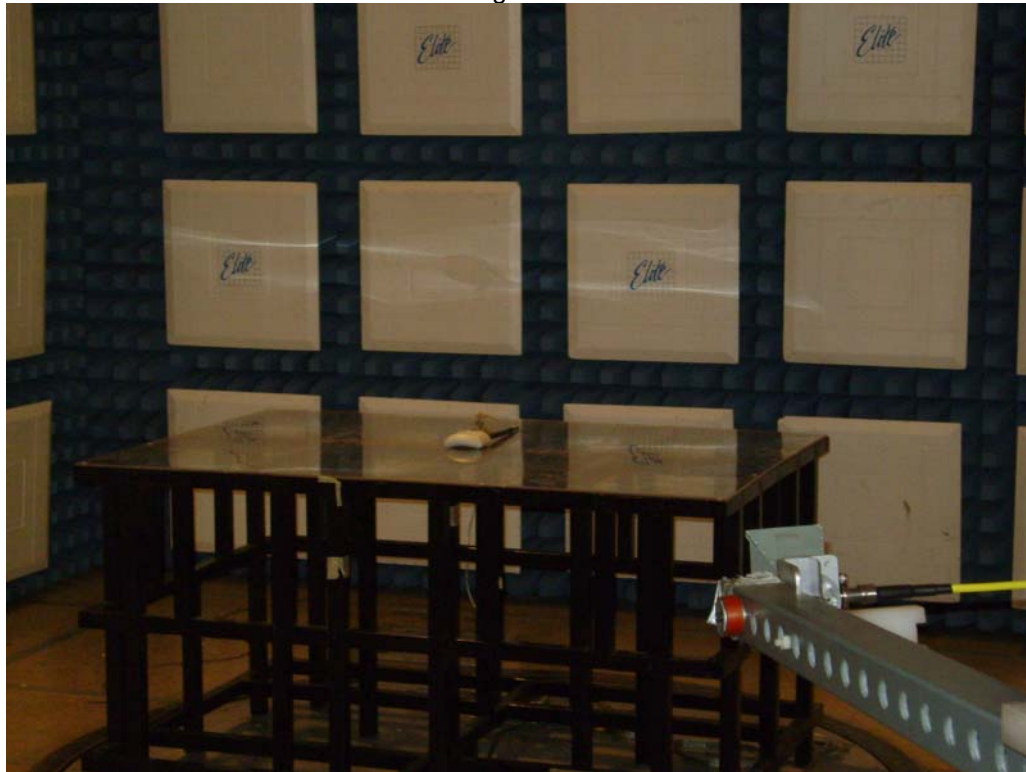
Test Setup for Radiated Emissions – 2GHz to 18GHz, Horizontal Polarization