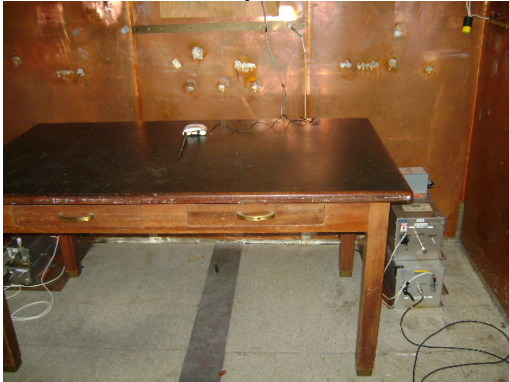
Test Setup for Conducted Emissions