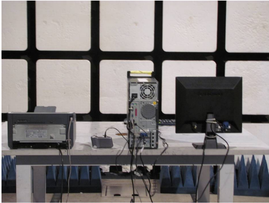
Conducted Measurement Photo