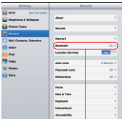
Click to turn on Bluetooth setting

Step 4:On the settings menu,select item [General] to access [Bluetooth] settings. Click on [Bluetooth] to turn on the connection. mini iPad will automatically sear-ch for a Bluetooth-enabled device.