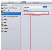
Keyboard connected successfully

Step 7:Wireless keyboard connected successfully.[power] indicator light will stay on until the keyboard is swithed off.