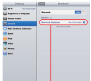
Click on the keyboard to connect

Step 5:Wireless Keyboard found.Click on the device to connect.