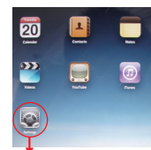
iPad [setting] icon

Step 3: Turn on and unlock iPad. Click on the iPad [settings] icon.