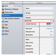
Click to turn on Bluetooth setting

Step 4: On the settings menu, select item [General] to access [Bluetooth] settings. Click on [Bluetooth] to turn on the connection. iPad will automatically search for a Bluetooth-enabled device.