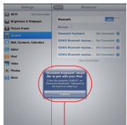
Enter password code using the wireless keyboard

Step 6: Enter the password code as displayed on screen.