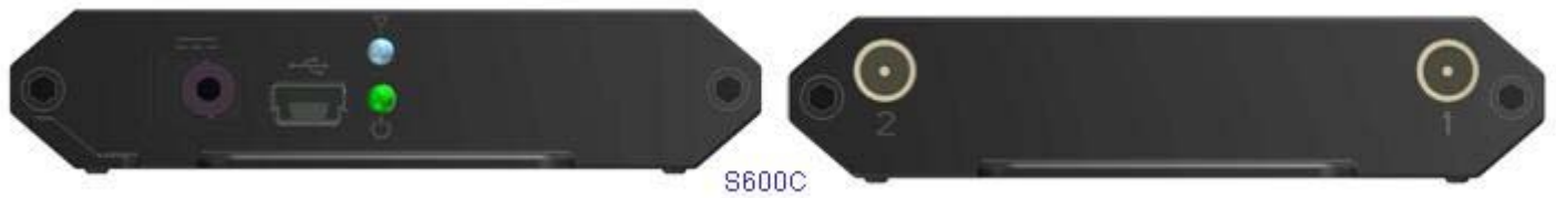
Figure -4 Port definition of RF connectors