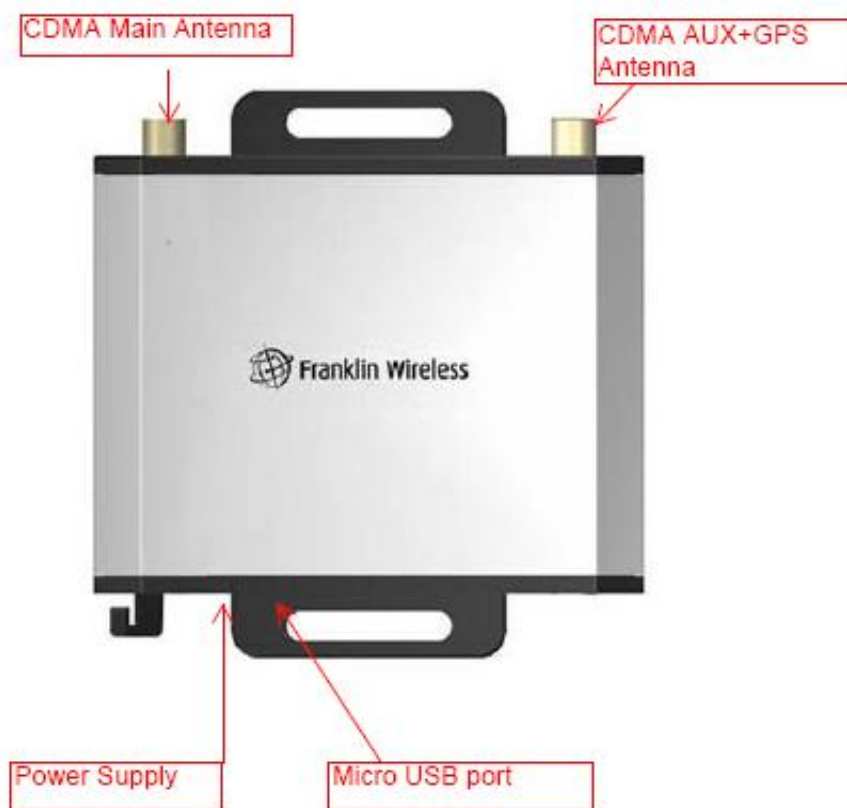
Figure-1 Structure of the S600C