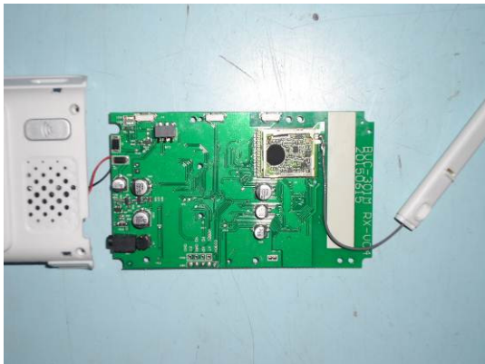
Front View of the Inner Circuit