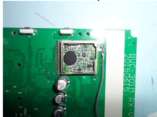
RF module of the product