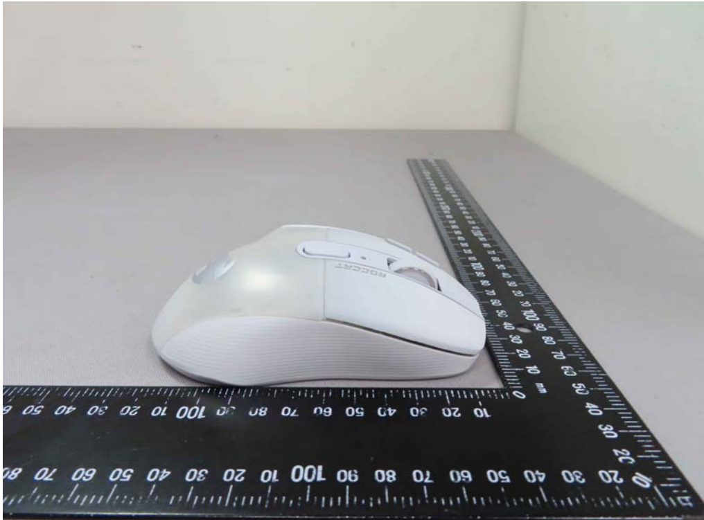
Side View of EUT – 2