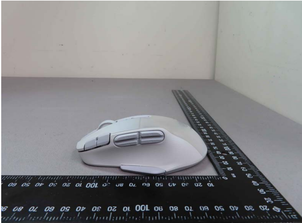
Side View of EUT – 4