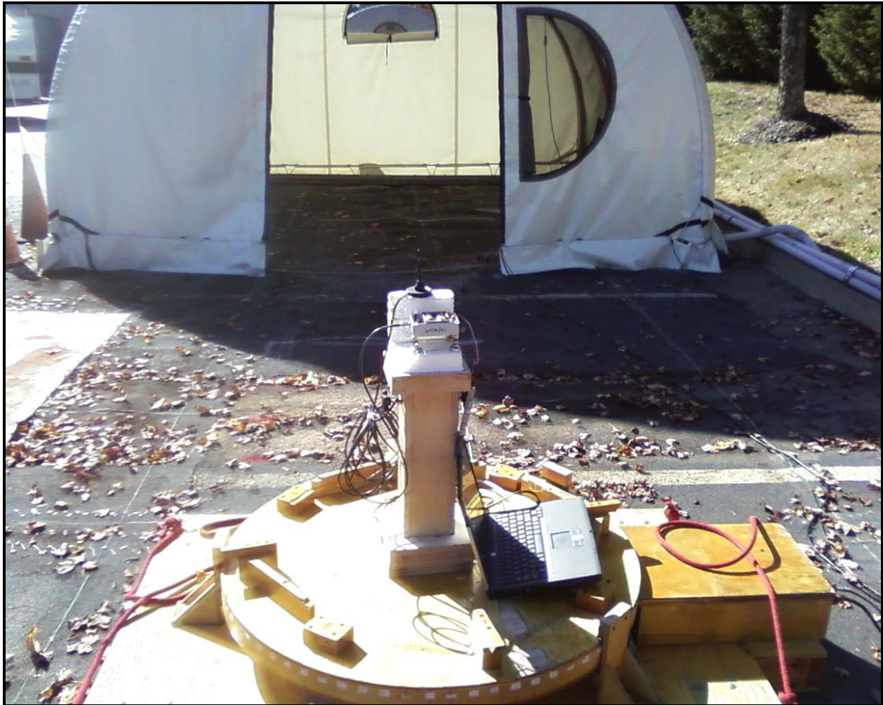
Photograph 1: Radiated Testing – Front View