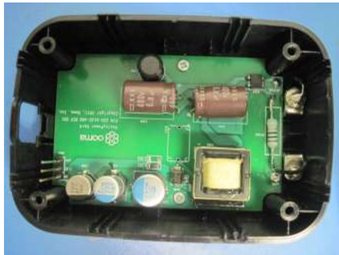
Photograph 4. Power Board Top