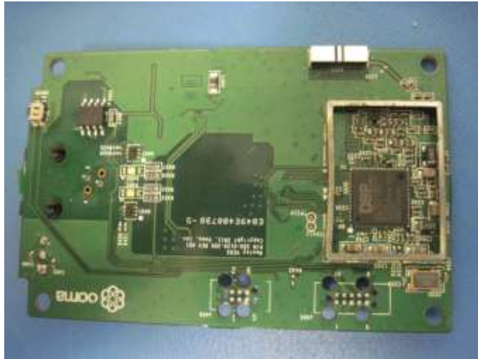
Photograph 5. RF Cover Off