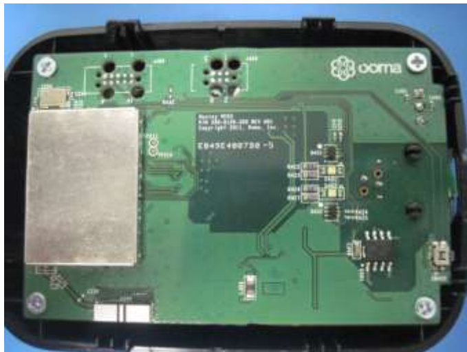
Photograph 2. Cover Off