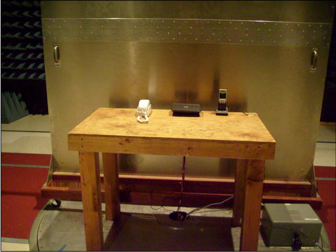
Photograph 1. Conducted Emissions