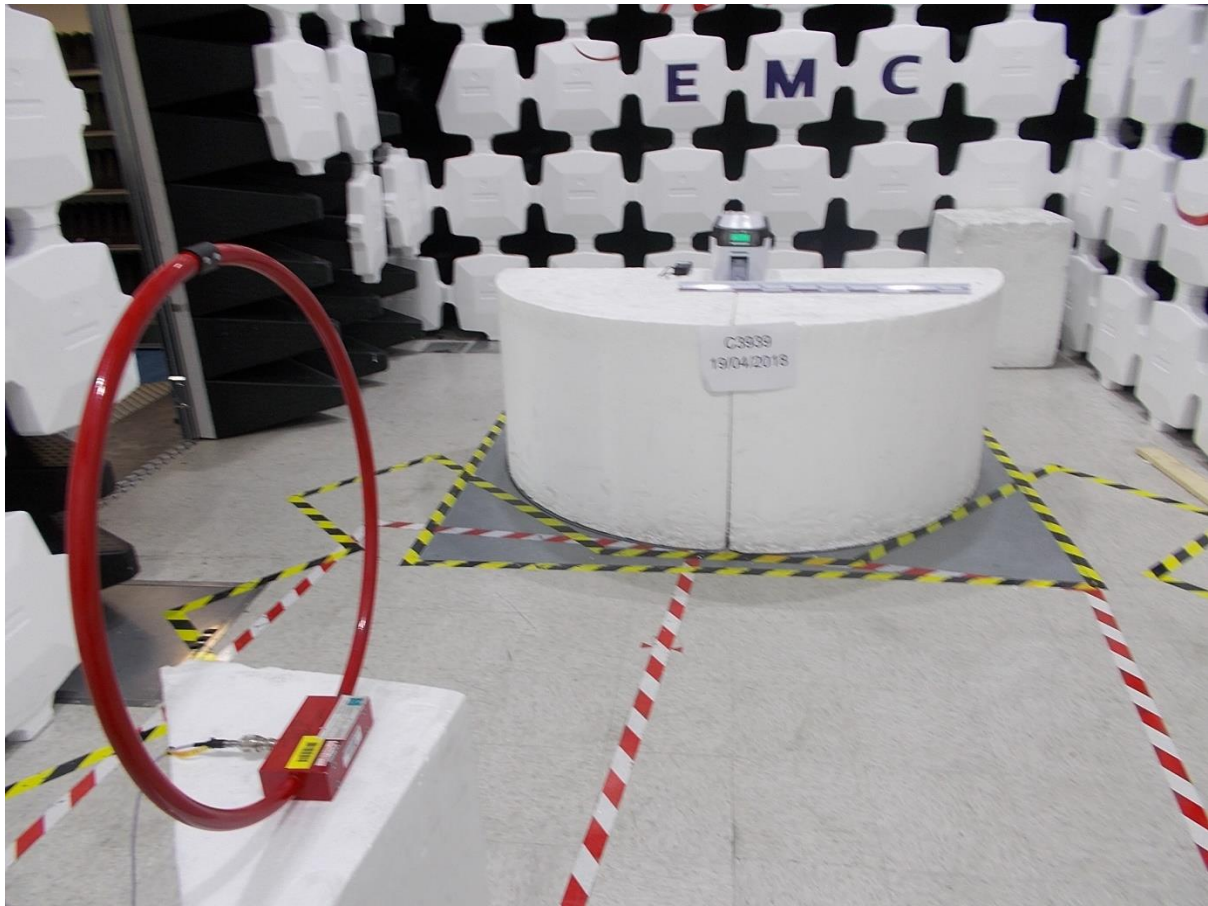
Radiated emissions 9kHz to 150kHz