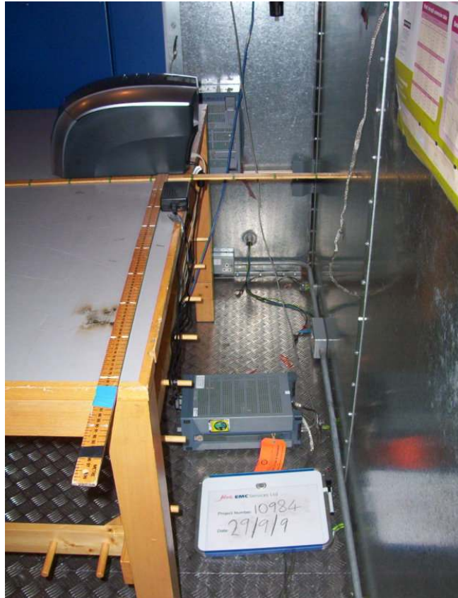
Photograph 1 Conducted emissions testing