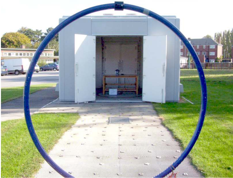
Photograph 2 Radiated emissions testing (9kHz to 30MHz), Open Area Test Site Tests performed at a 10m measurement distance