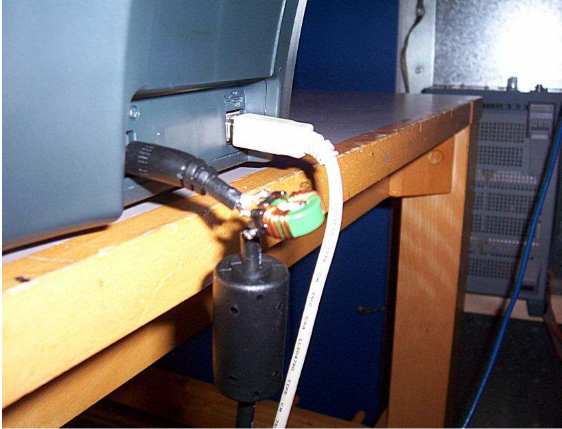
Photograph 5 30uH common mode choke fitted to mains supply lead