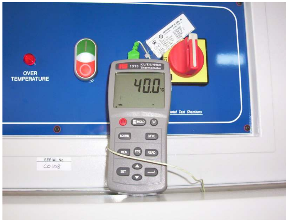
Photograph 4 Frequency stability testing