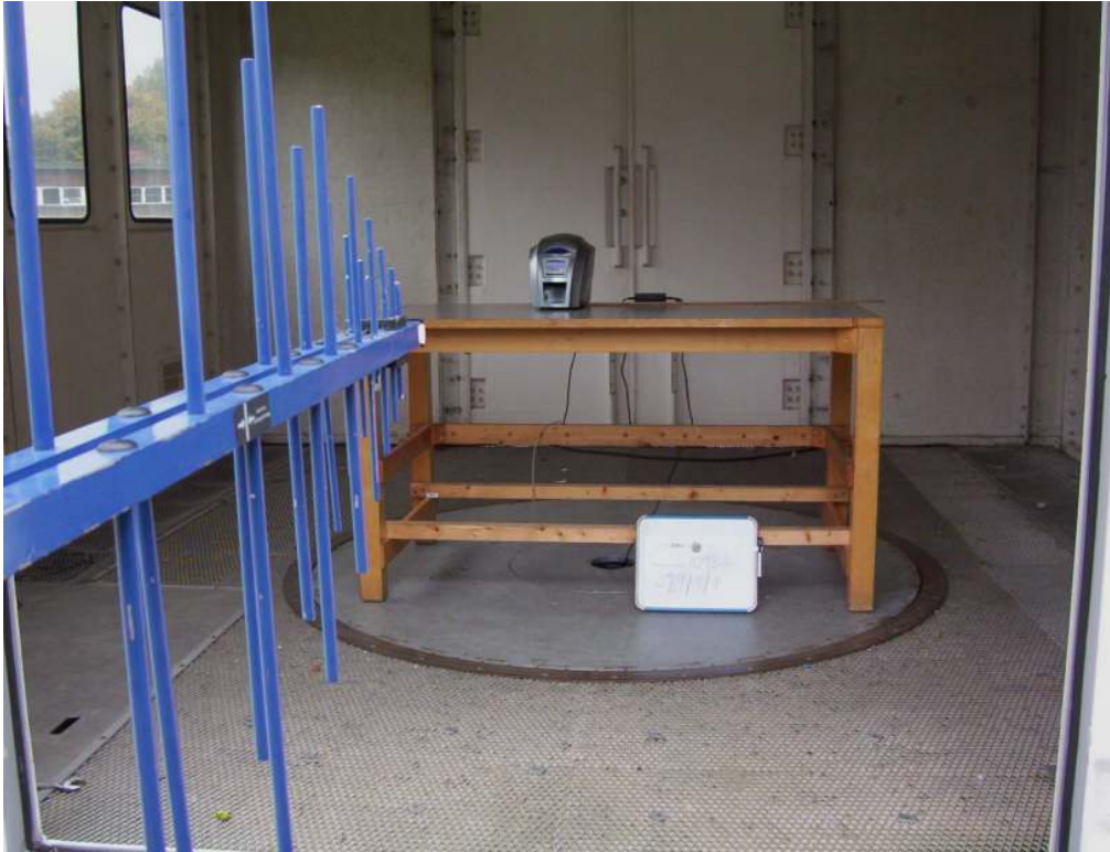
Photograph 3 Radiated emissions testing (30MHz to 1GHz), Open Area Test Site Tests performed at a 3m measurement distance