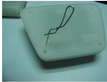
Figure 3: Beacon Pairing Hole