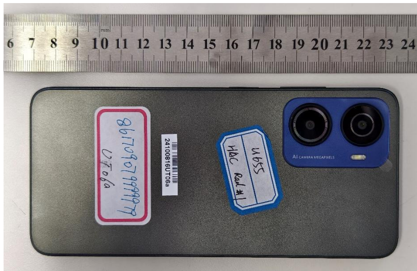
Pic 2 Mobile Phone(back)