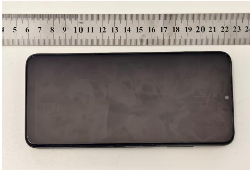
Pic 1 Mobile Phone(top)