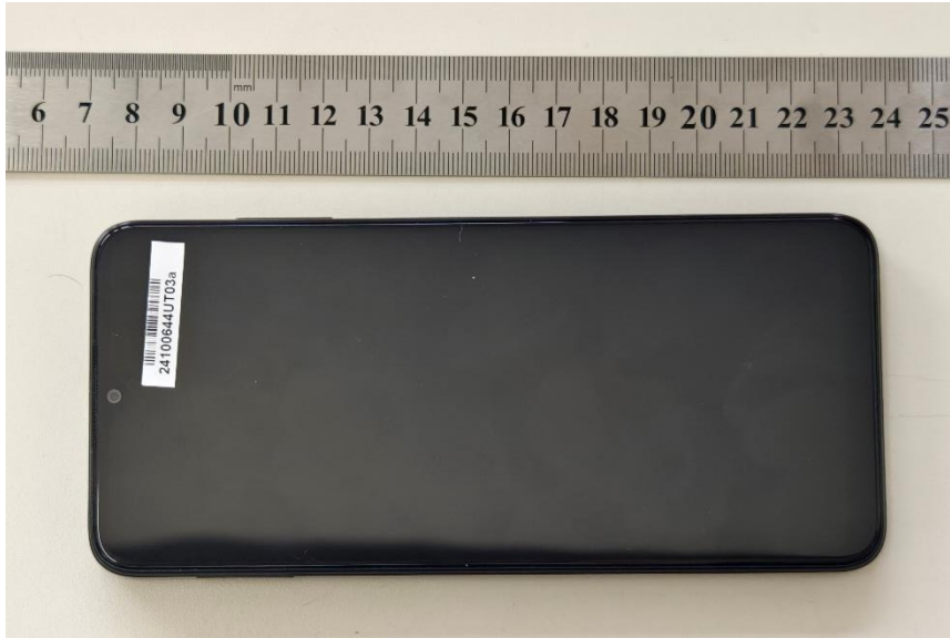
Pic 1 Mobile Phone(top)