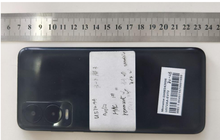
Pic 2 Mobile Phone(back)