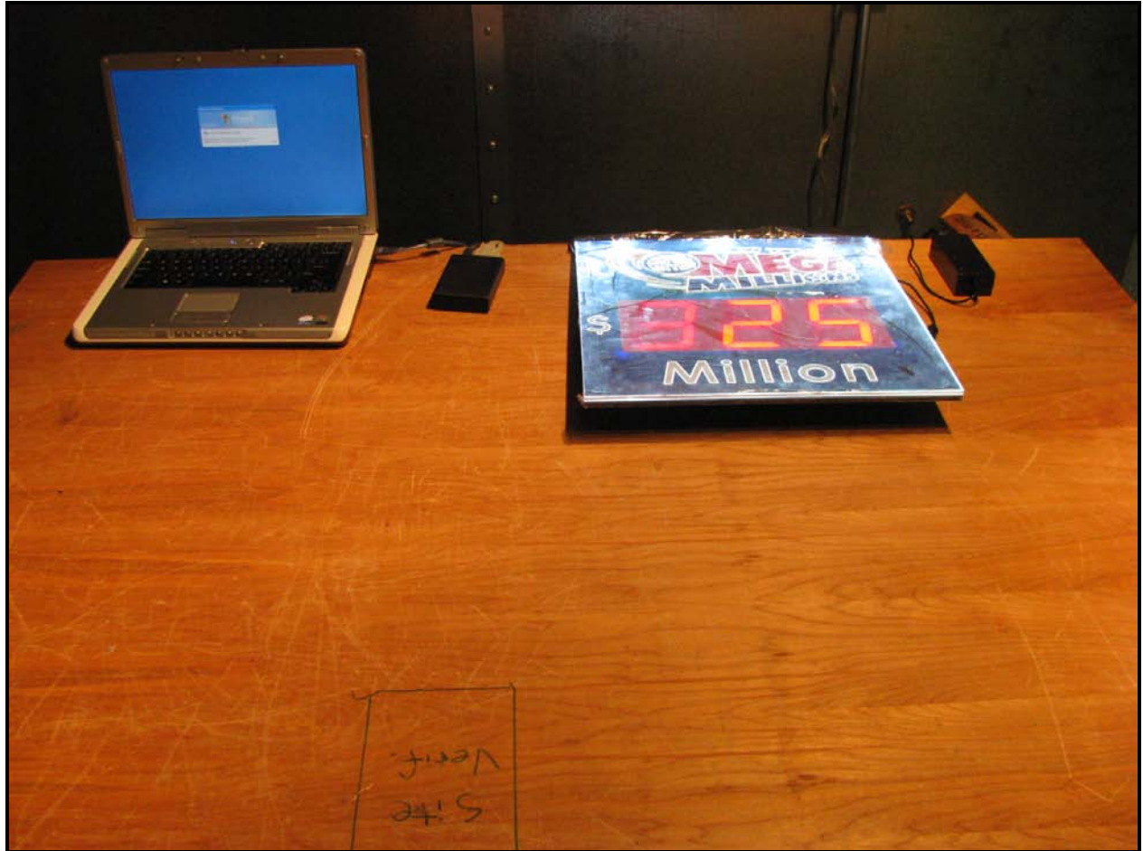
Photograph 4: AC Line Conduced Emissions - Front View

Client: Supervision Two Inc. Model: Lot062009 Standards: FCC 15.231 FCC ID: XD4-062009LOTSIGN Report #: 2009179