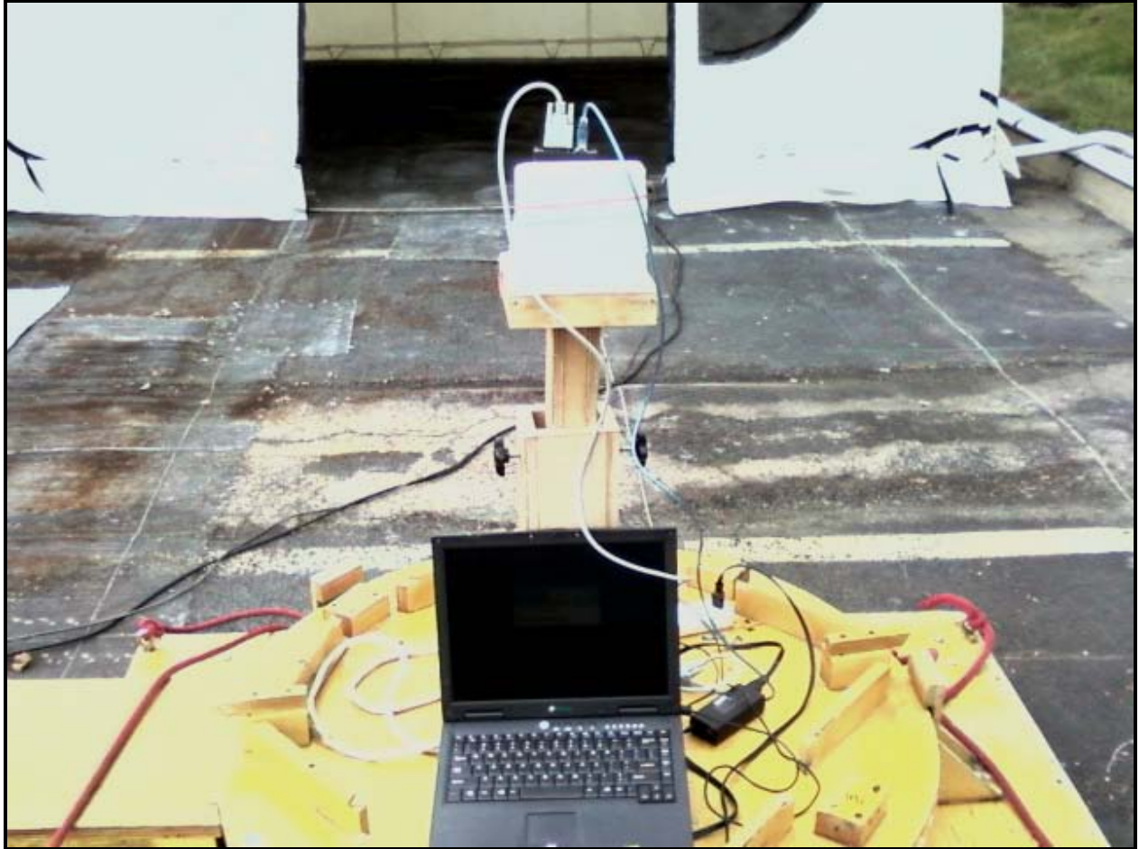
Photograph 3: Radiated Emissions - Back View