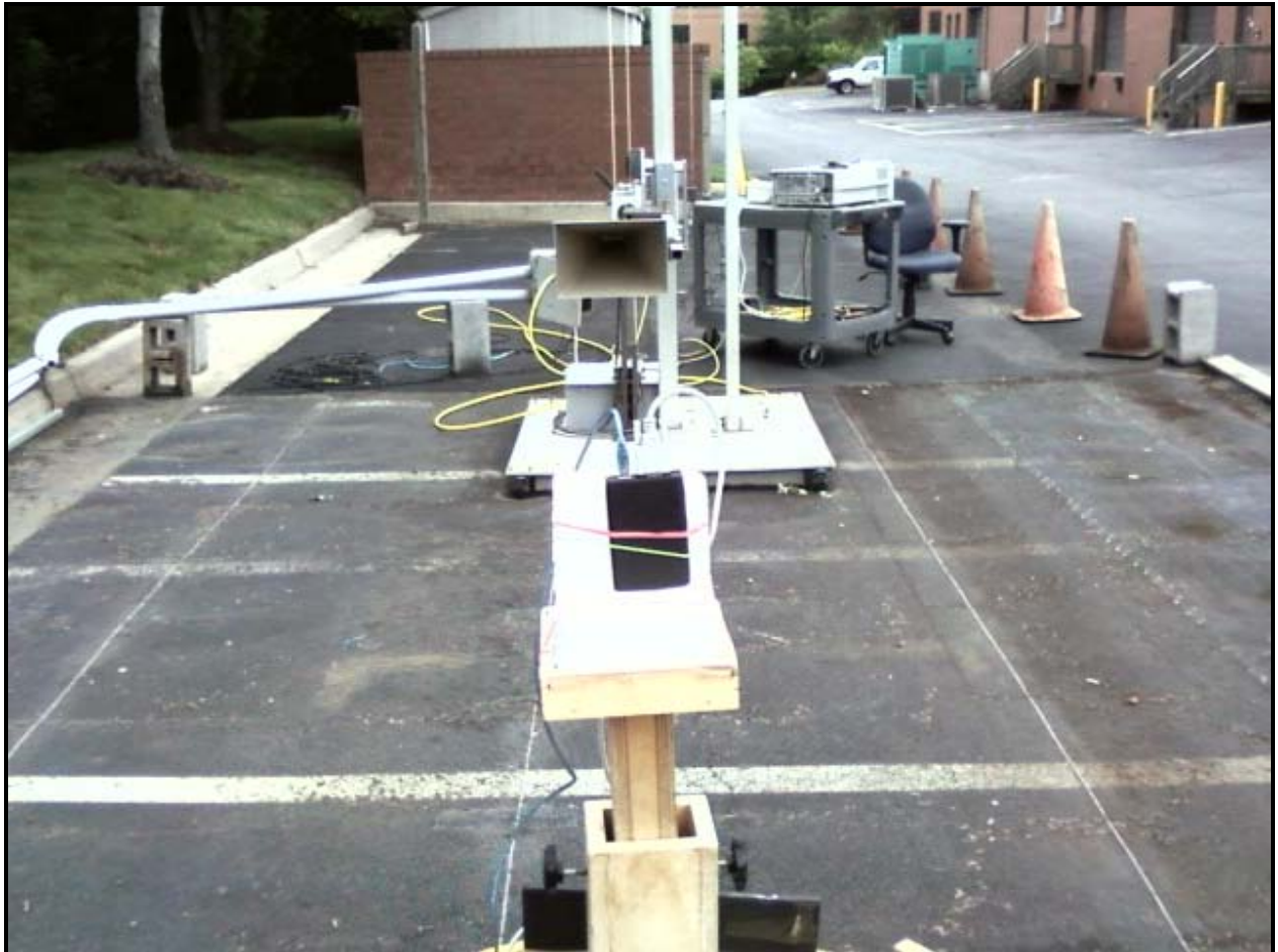
Photograph 2: Radiated Emissions - Front View