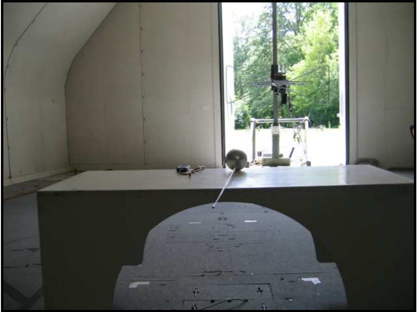
Open area test site measurements with Trilog Antenna