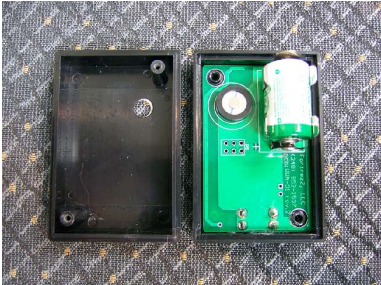
Photo One Open for Inspection