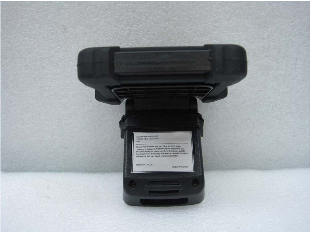
Figure 1.2 LABEL LOCATION

The label shown shall be permanently affixed at a conspicuous location on the device and be readily visible to the user at the time purchase. (Labeling requirements per 2.925)