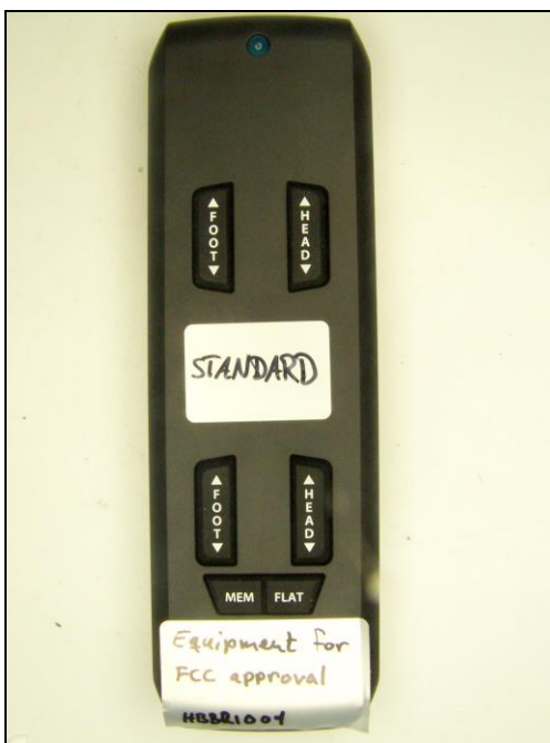
Photograph 1. Front View of EUT

The HB BRIO handset / HBBRIO01, Equipment Under Test (EUT), is a RF remote control for elevation beds.