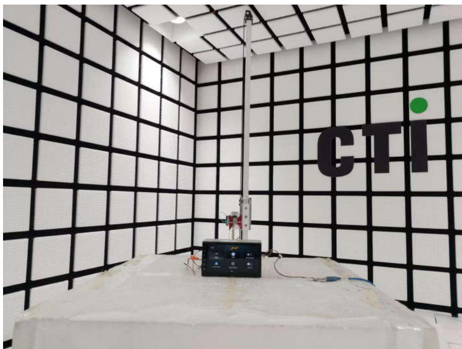
Radiated spurious emission Test Setup-2(Above 1GHz)