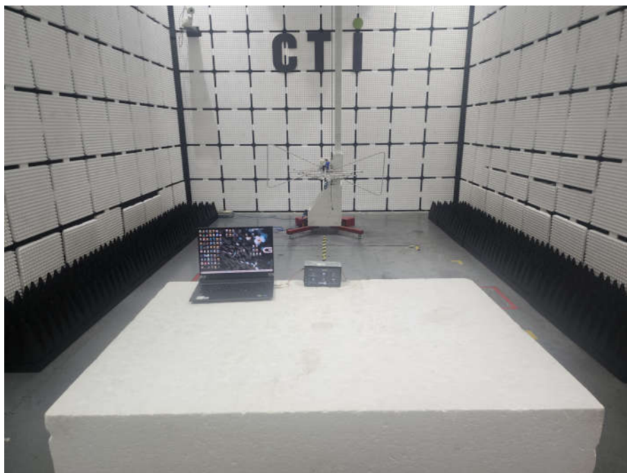
Radiated spurious emission Test Setup-1(Below 1GHz)