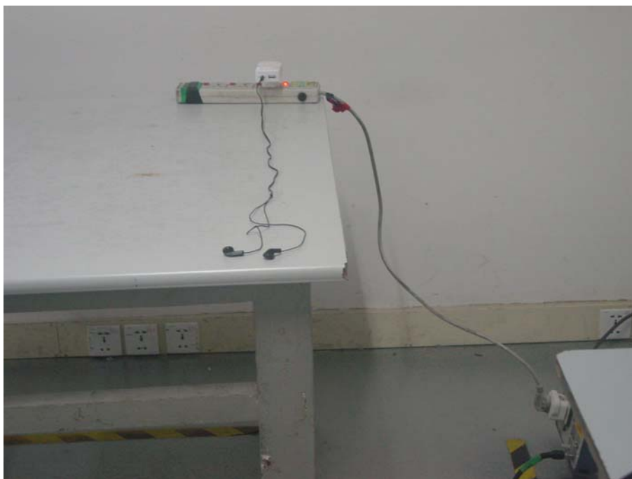
Set-up for radiated emission test(30MHz~1000MHz)