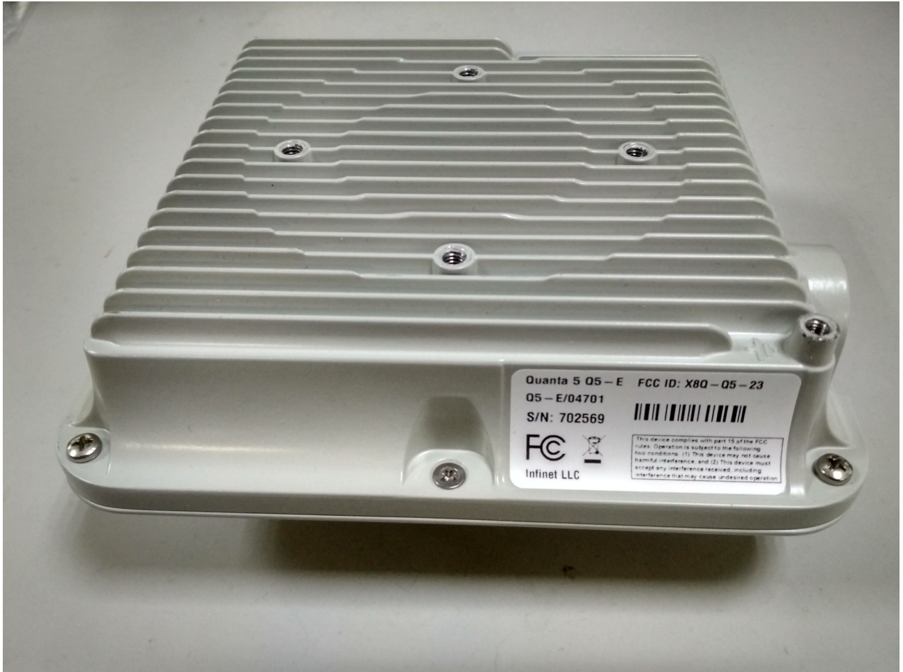
Label location on enclosure