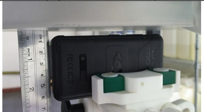
Right Side (Separation distance of 5mm)