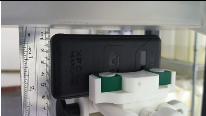
Left Side (Separation distance of 5mm)