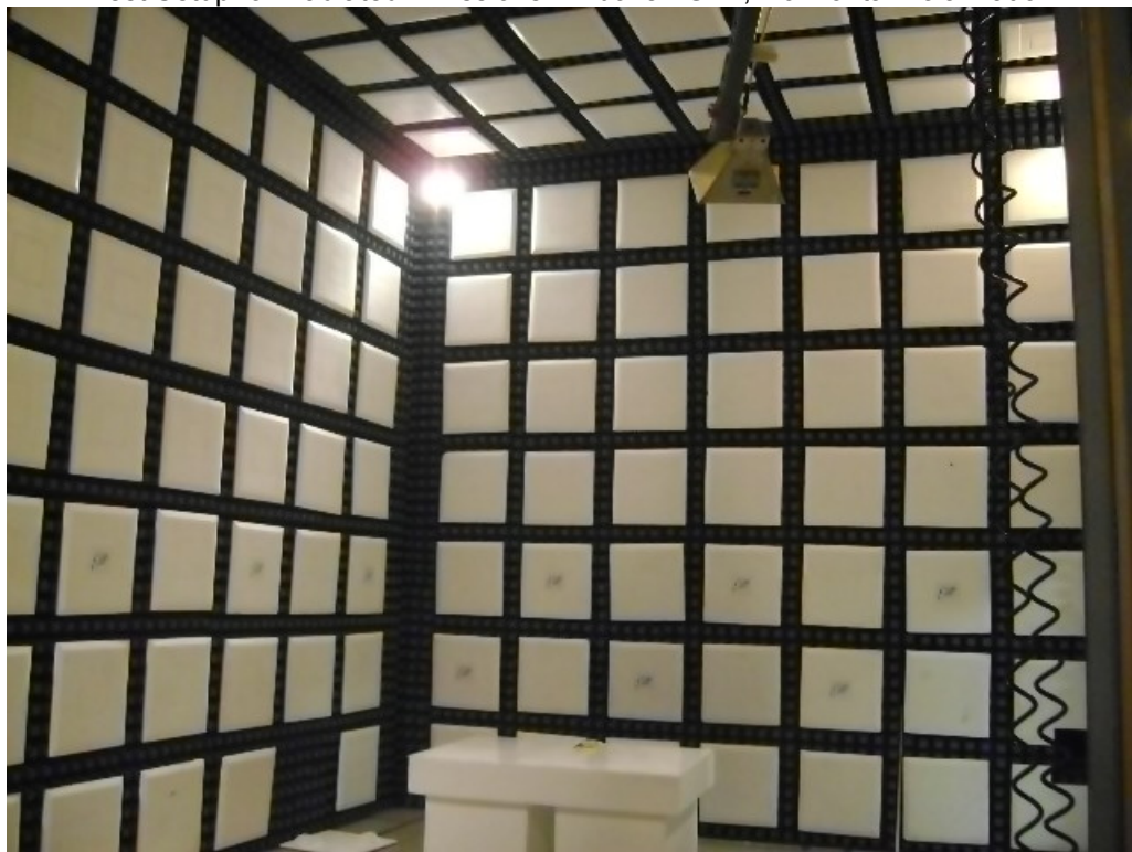
Test Setup for Radiated Emissions – Above 1GHz, Vertical Polarization