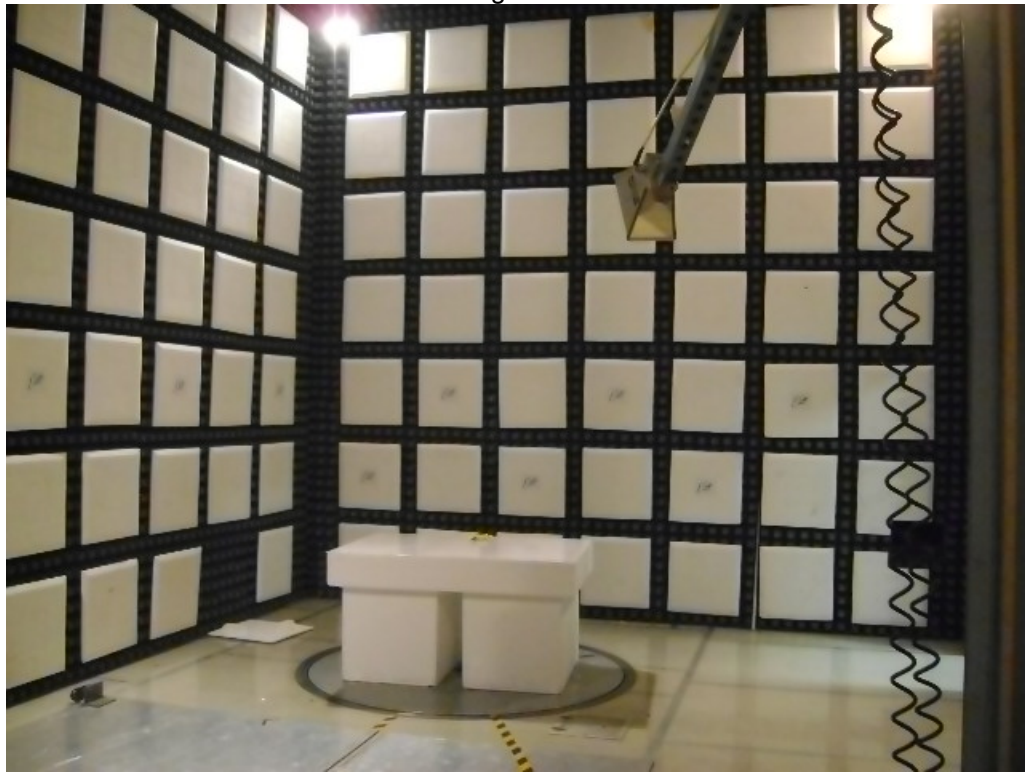
Test Setup for Radiated Emissions – Above 1GHz, Horizontal Polarization