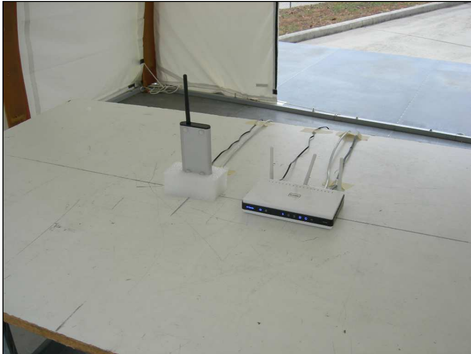
Figure 3: Radiated Emissions Test Setup – YPOS