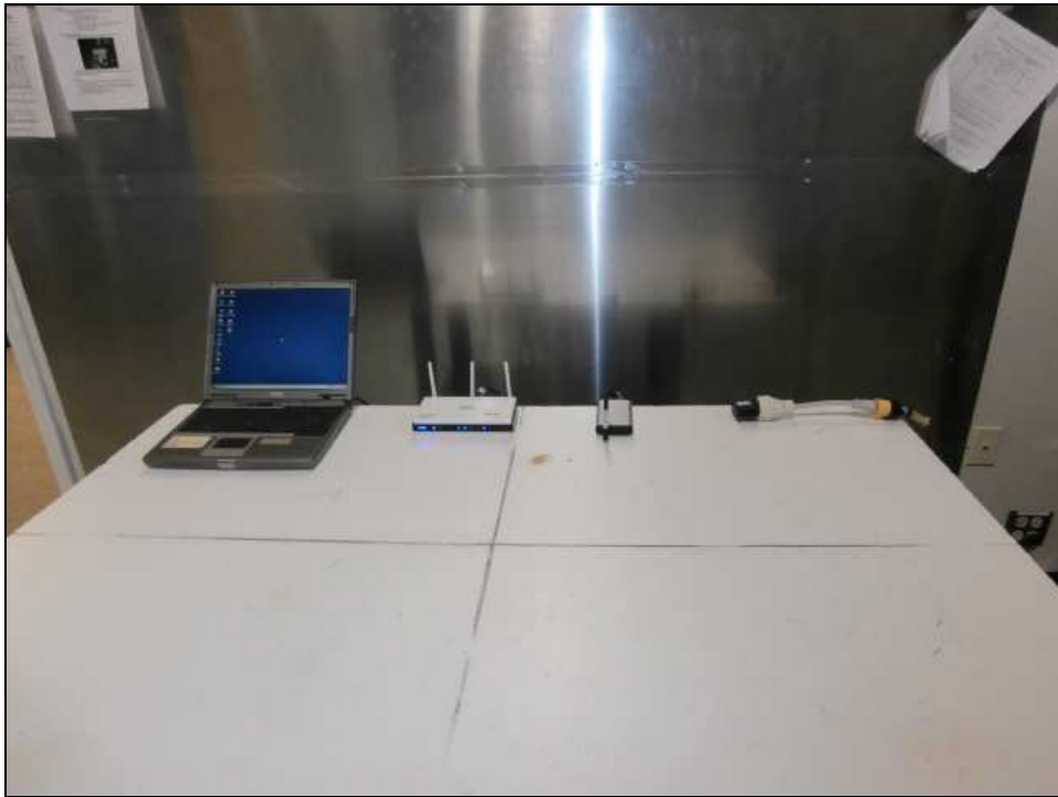
Figure 5: Conducted Emissions Test Setup