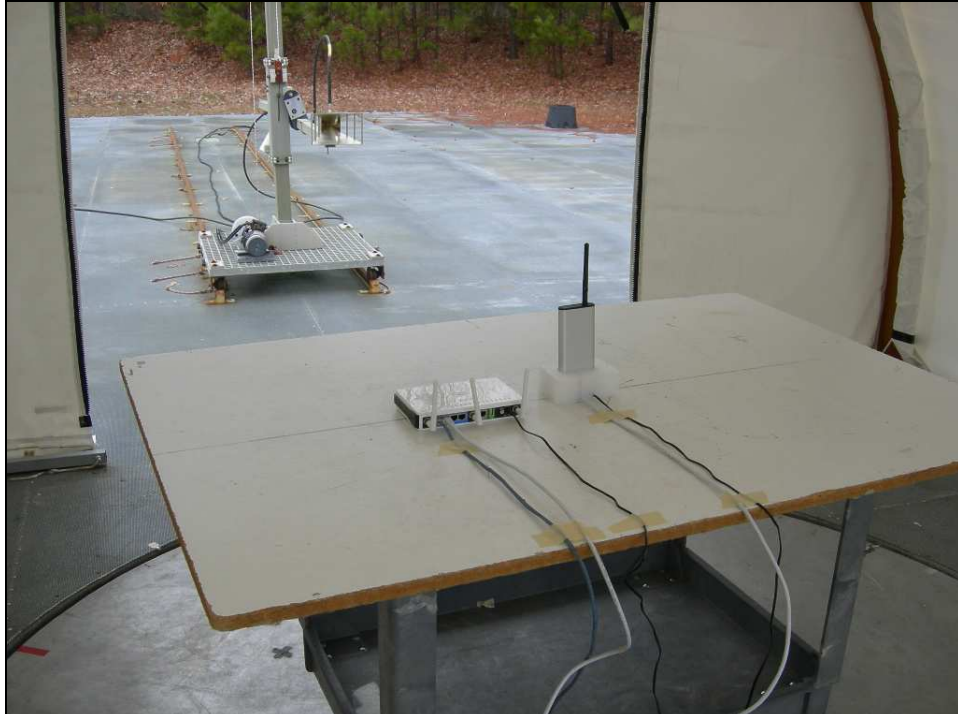
Figure 4: Radiated Emissions Test Setup – YPOS