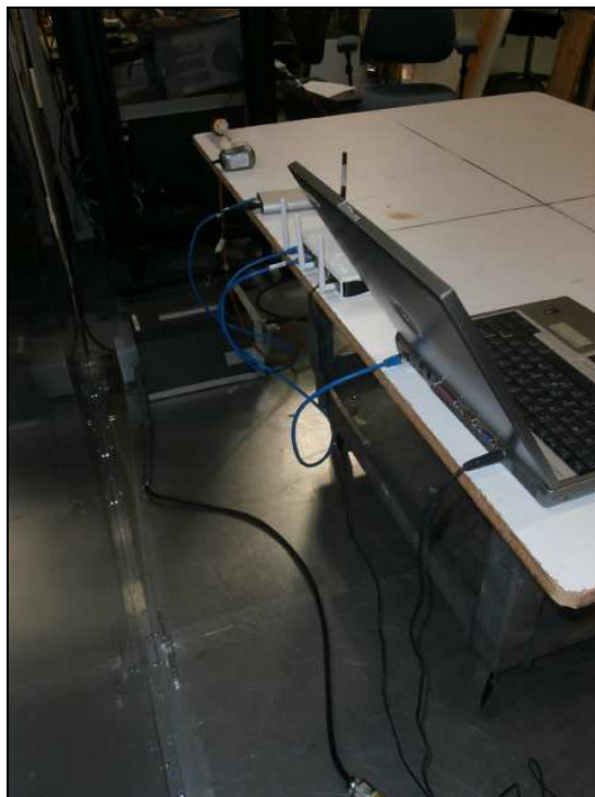
Figure 6: Conducted Emissions Test Setup