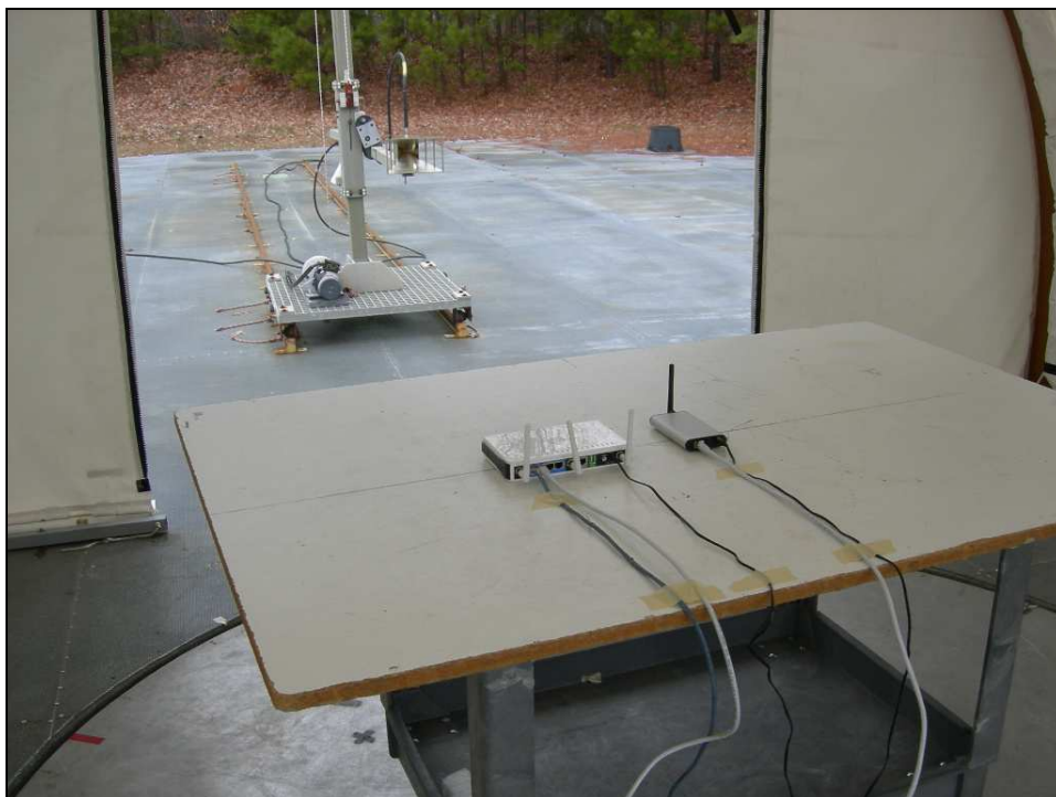
Figure 2: Radiated Emissions Test Setup – XPOS