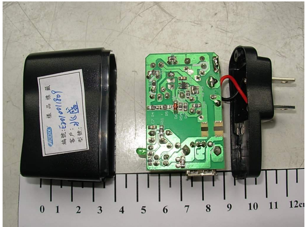
FIGURE 9 SIPOD IP WALKIE TALKIE (M/N: C200) ADAPTER MAIN BOARD (COMPONENT SIDE)