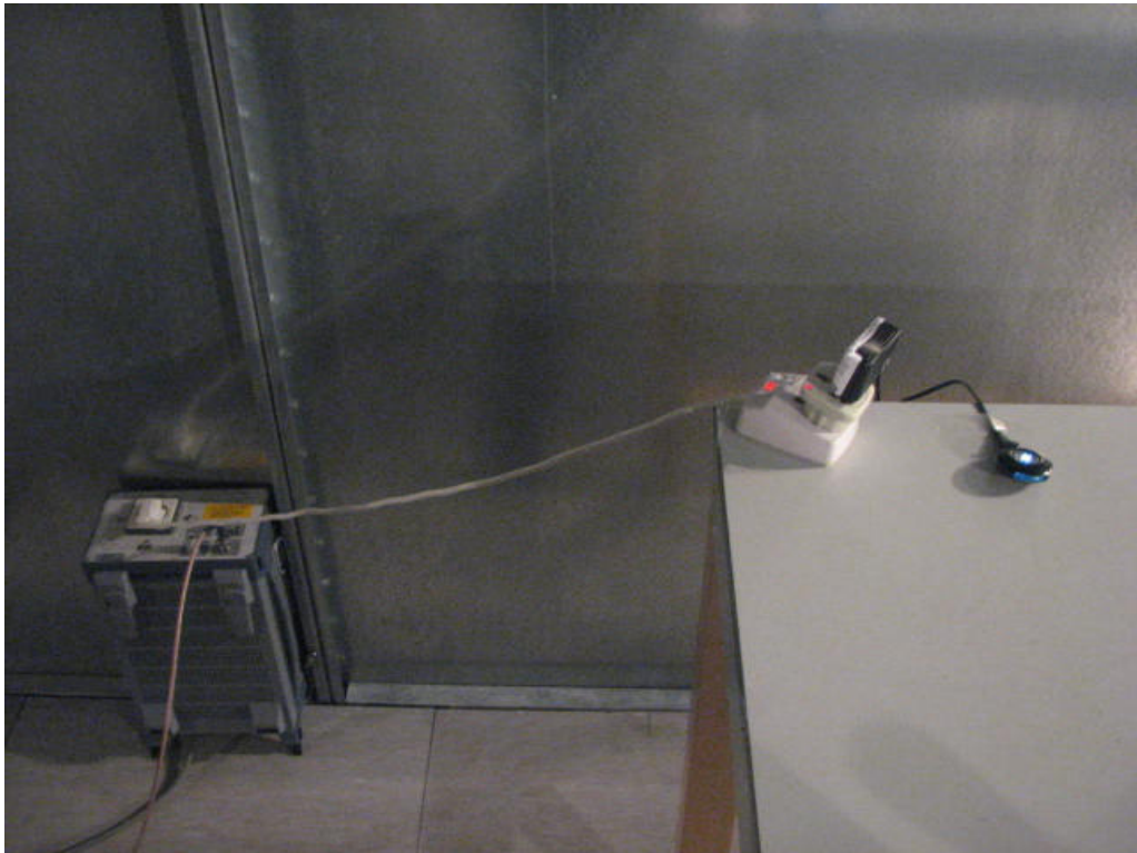
Set-up for AC wireline conducted emissions