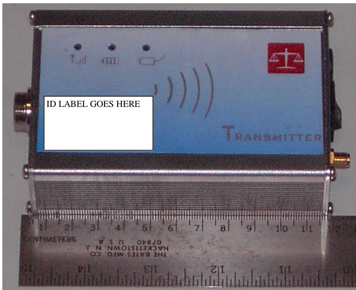
Photograph 2: ID Label Location