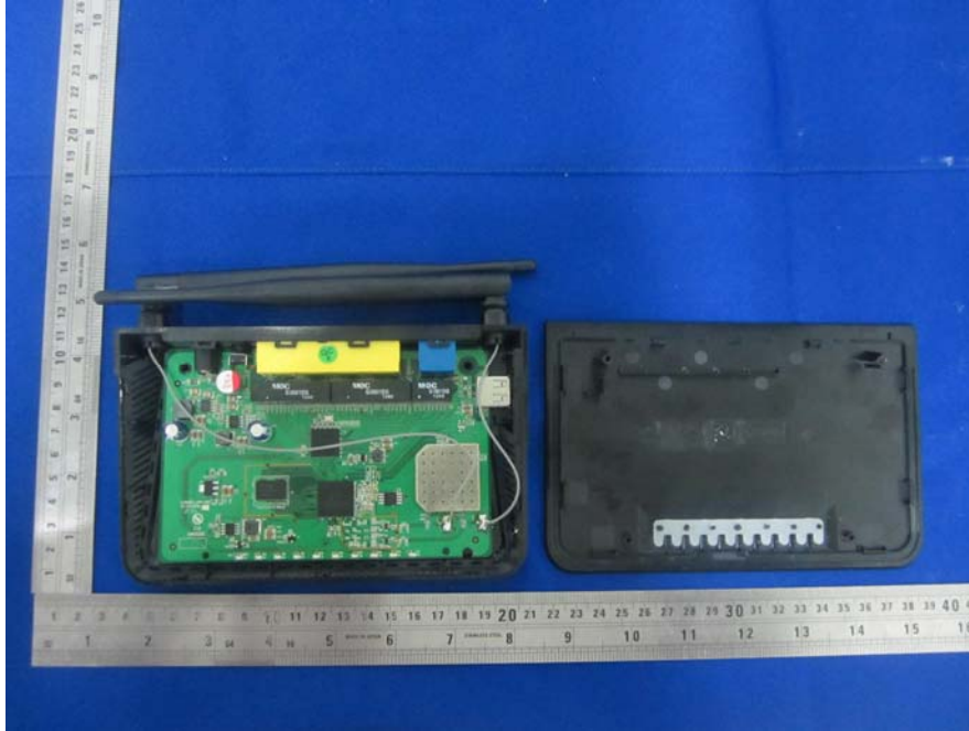
EUT – Cover off View