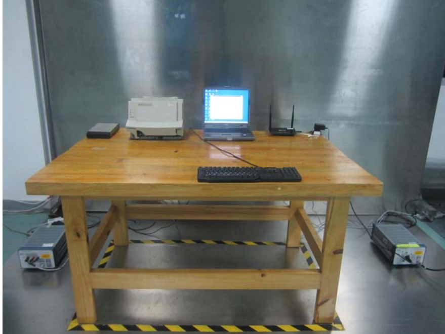
Conducted Emission - Side View