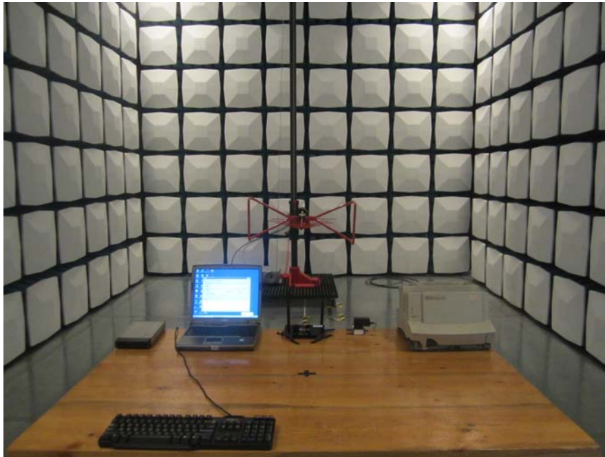
Radiated Emission – Rear View (Below 1 GHz)