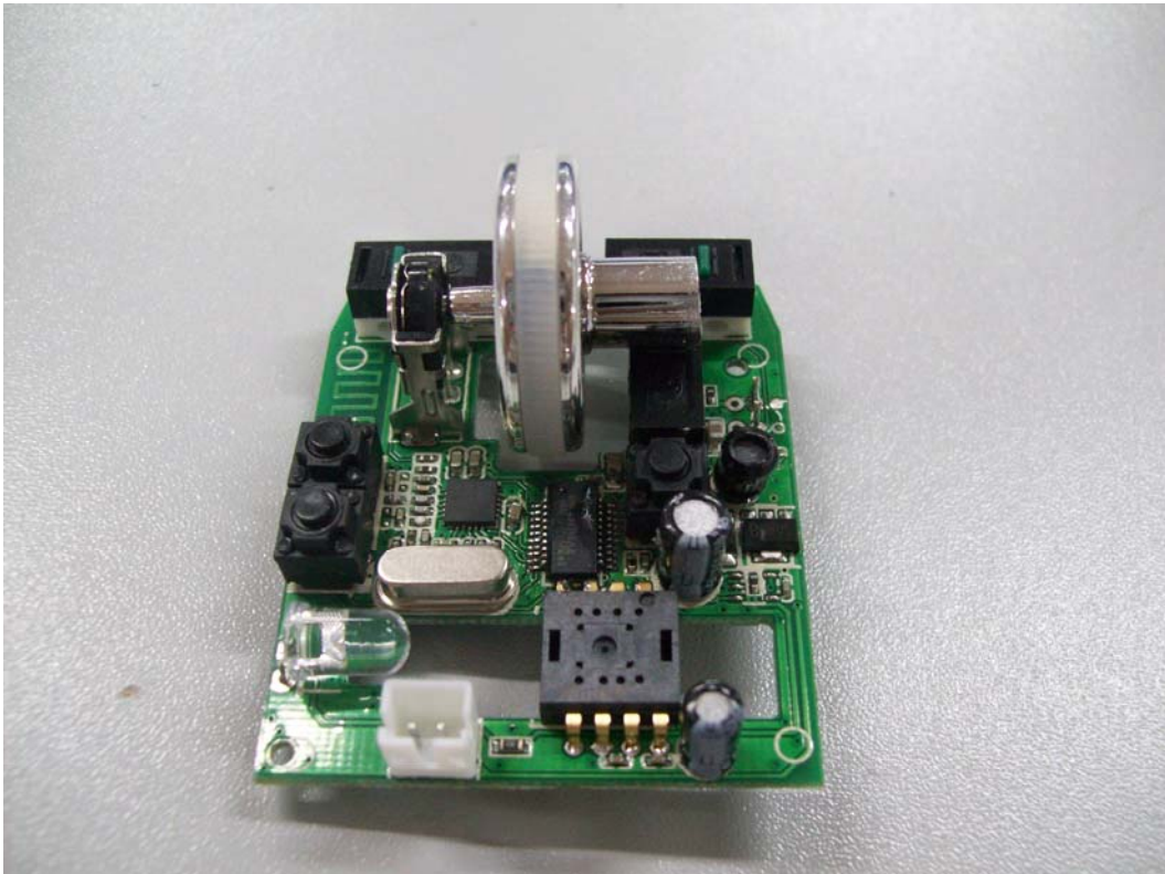
INTERNAL PHOTO OF SAMPLE - 2