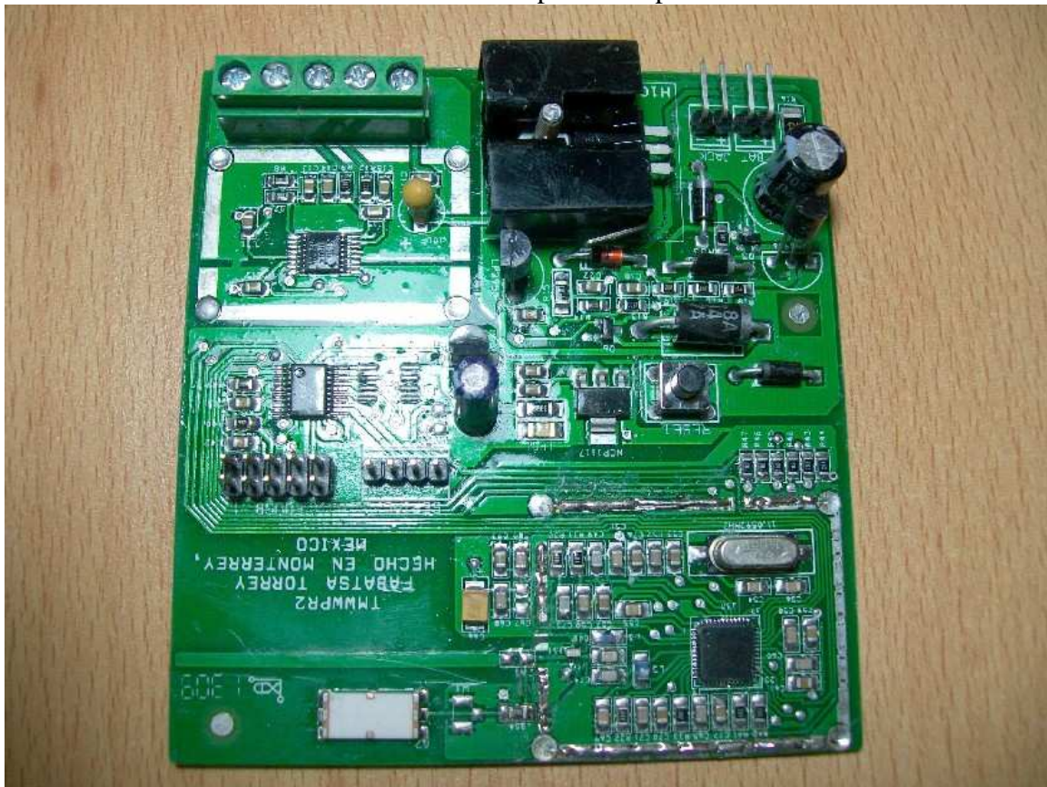
Transmitter PCB photo – top side