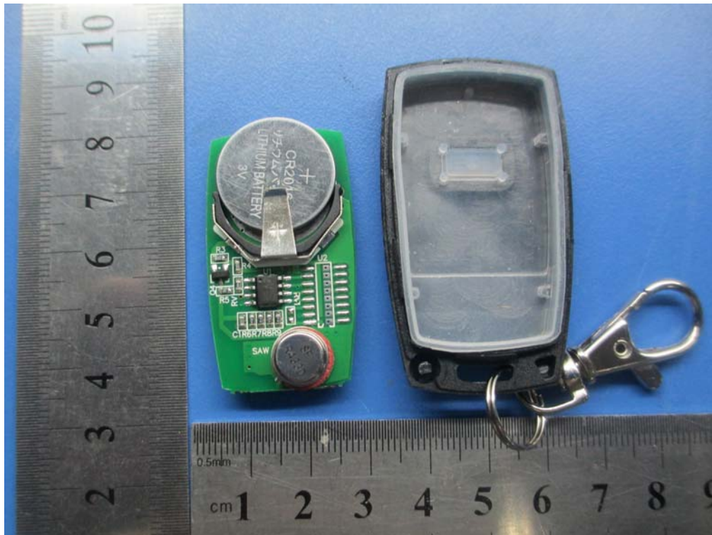
EUT (Transmitter) – Uncover Front View