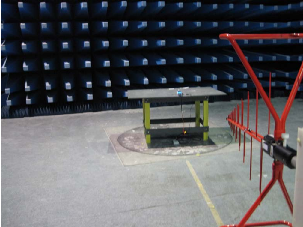
Radiated Emissions Test Set-up Front View