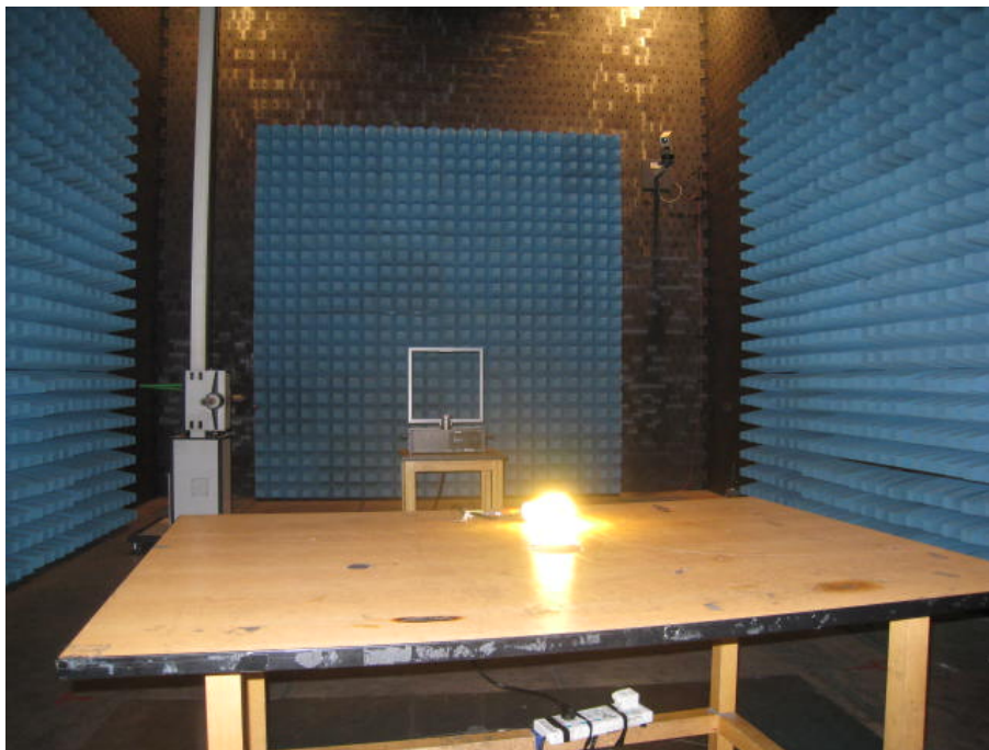
Radiated Emissions Test Set-up