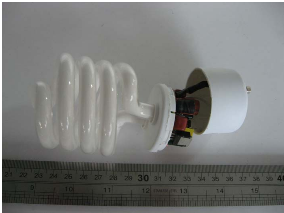
EUT Uncovered View