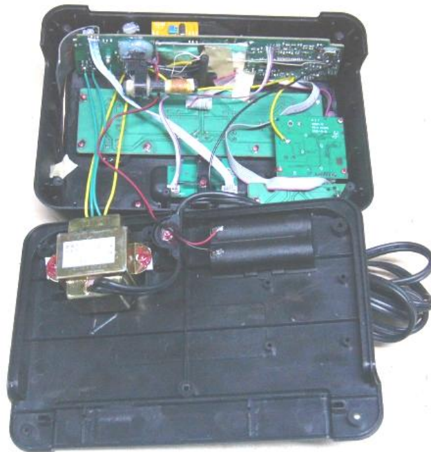
Main board component side